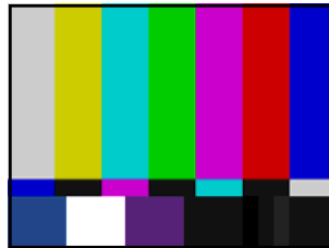
SMPTE COLOR BARS